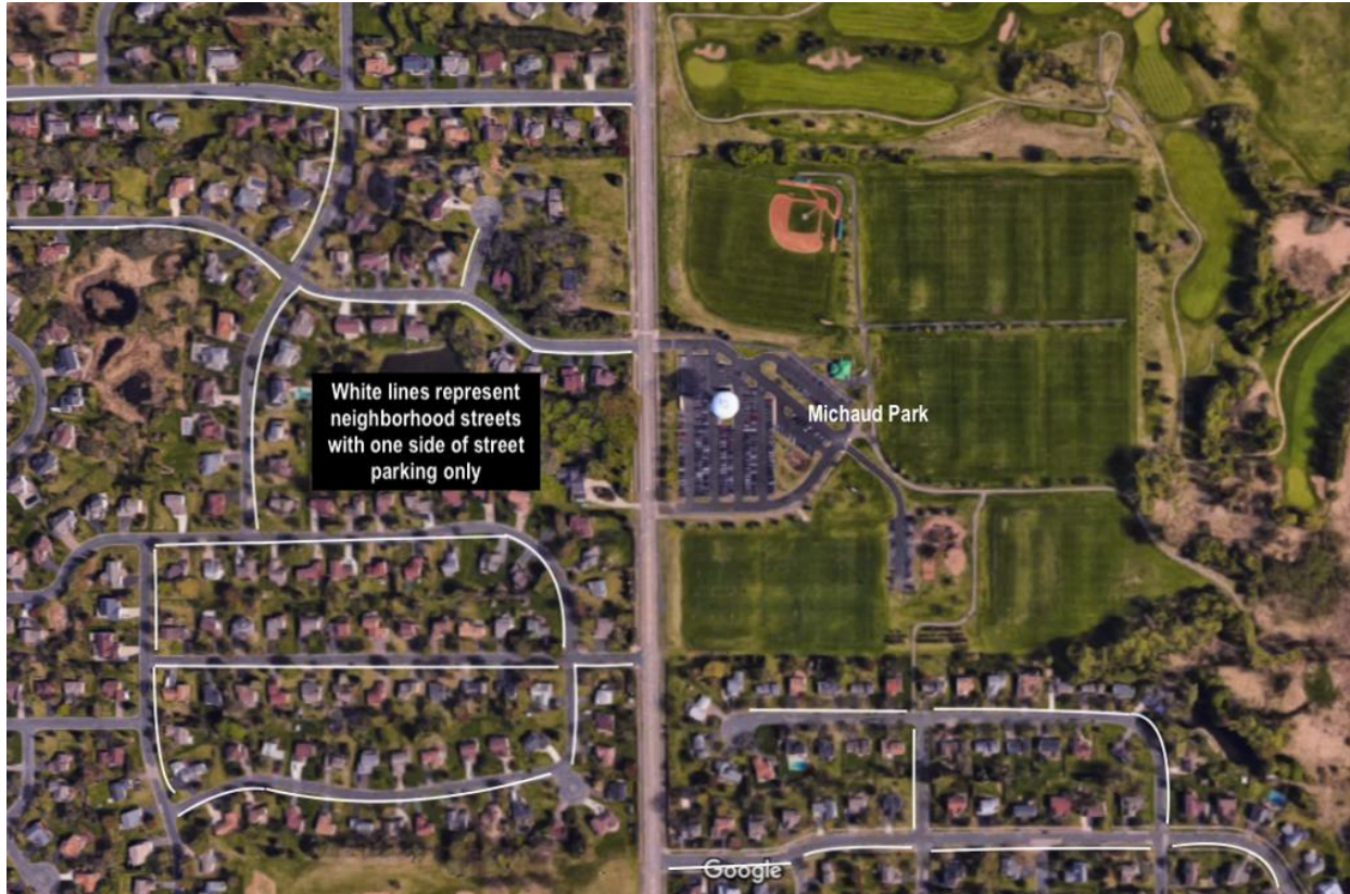
On Street Parking in surrounding neighborhoods