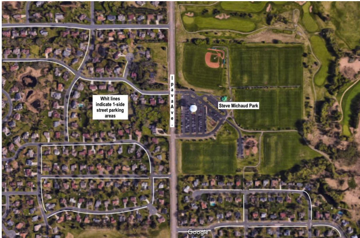
Applejack local neighborhood parking map