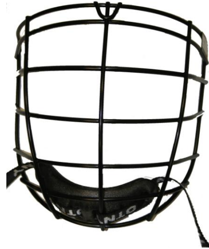
OTNY Intermediate/Senior Lacrosse Cage Kit