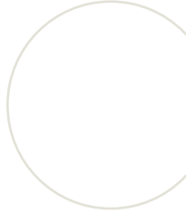
Table 3: Scholarship Opportunities in the CHL